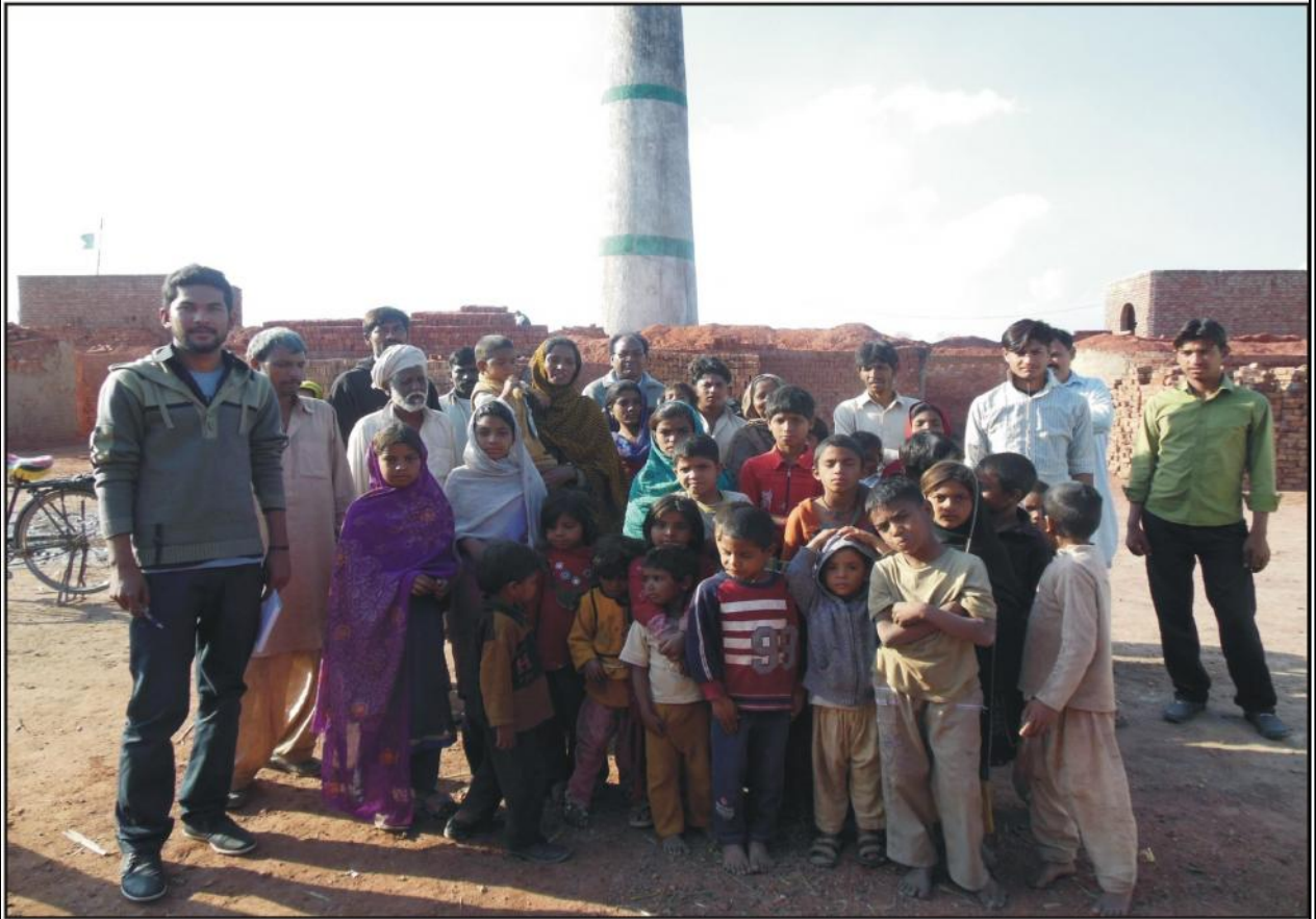
Group Photo with the Parents and Students on the Brickkiln